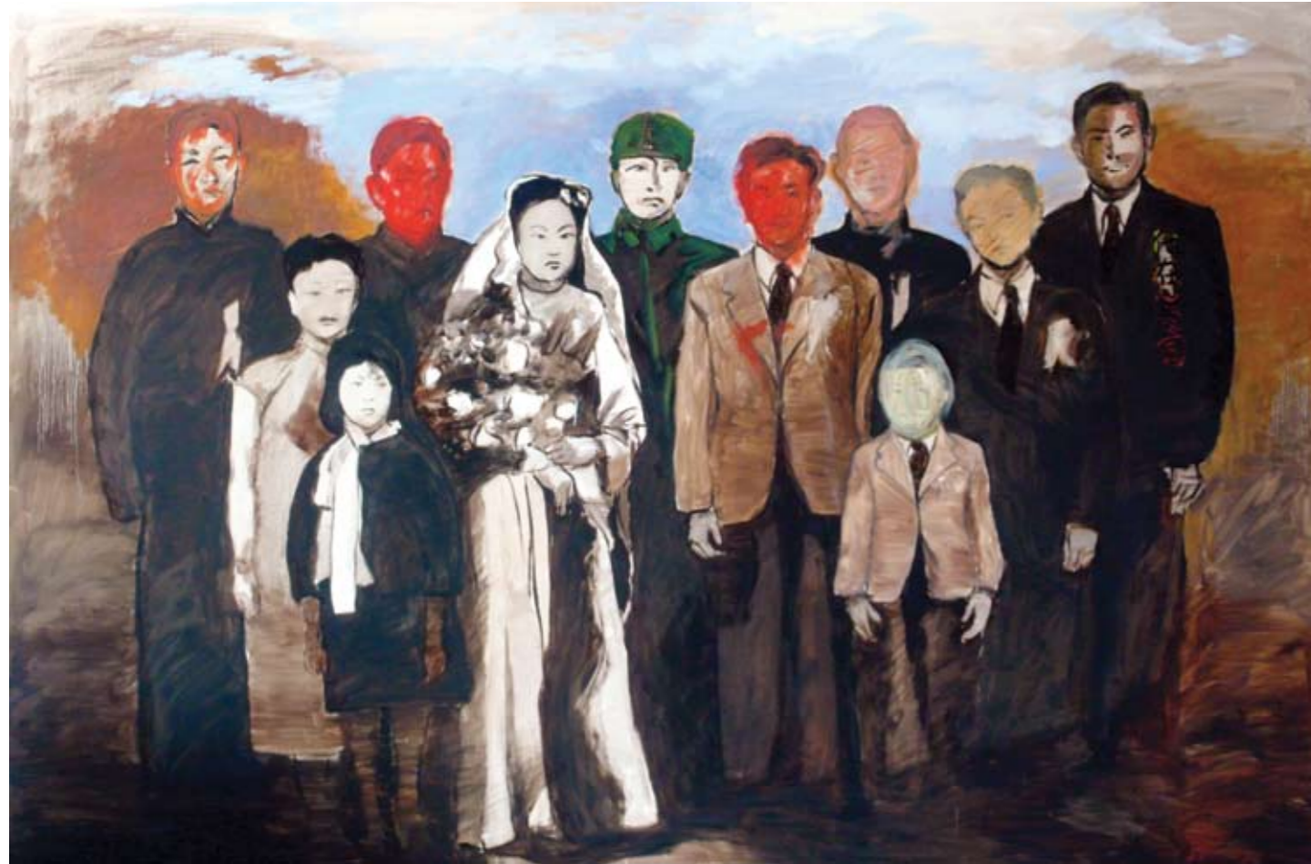
Gang Zhao: Wedding , 2007, 200 x 300 cm, oil on canvas