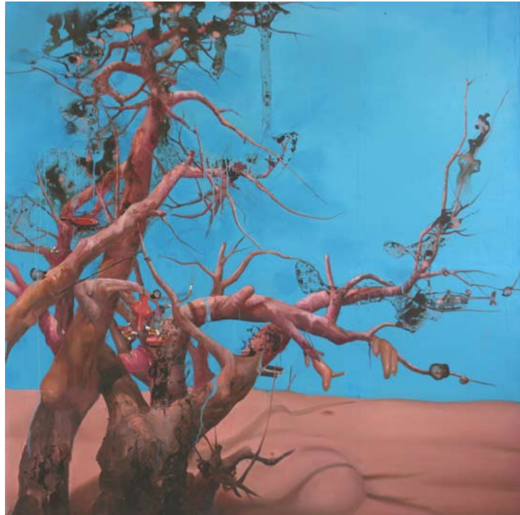
Tianbing Li: Arbre I , 2002, 200 x 200 cm, oil on canvas