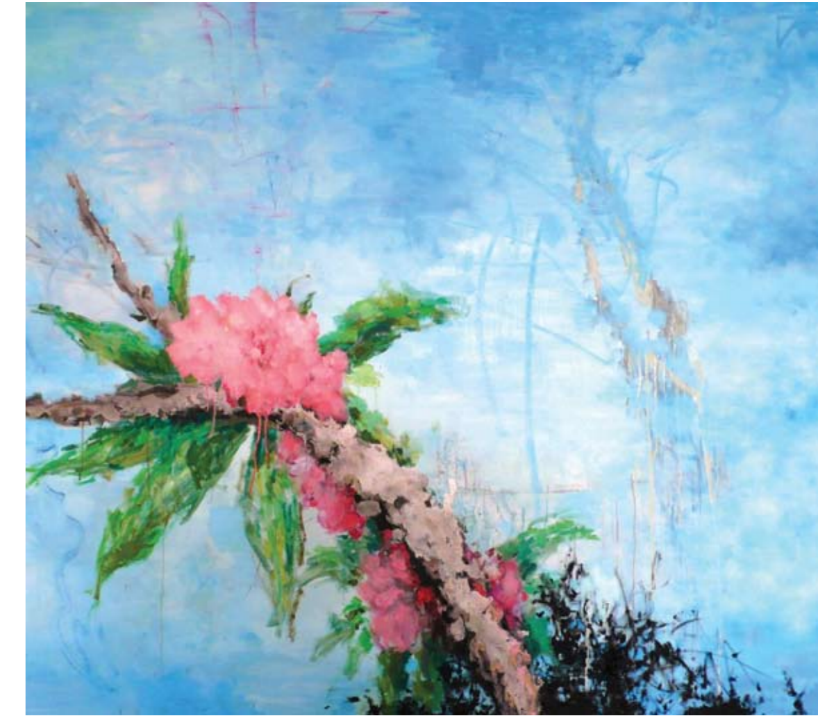
Wei Liu: Flowers , 2007, 150 x 150 cm, oil on canvas